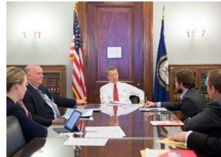
Scenes from past Day on the Hill meetings.